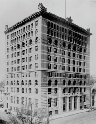
Real Estate Title Insurance Company was established in Minneapolis, Minnesota